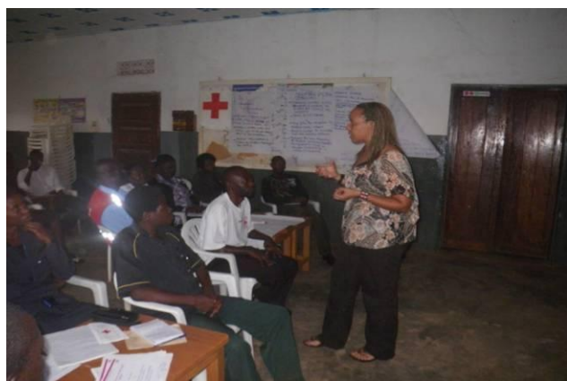
ICRC –cooperation delegate facilitating a RCAT training session in Busia.

ICRC supported 15 branches and 1 sub branch for refresher training of the Red Cross Action Teams targeting 15 team members each. The training focused on dissemination, first Aid & emergency response knowledge and skills. As a result of these trainings, a resource capacity of 262 Red Cross Action team members (74 Females: 188 Males) was established for action in their respective branches. Ensuing results indicated that some of these RCATs were very instrumental in supporting their branches in dissemination of Red Cross, conducted disaster assessments, participated in relief distributions to the disaster affected communities and providing first aid services during the period that preceded the elections. Details of the interventions will be in the final Election preparedness plan report that at the end of the project in March 2011.