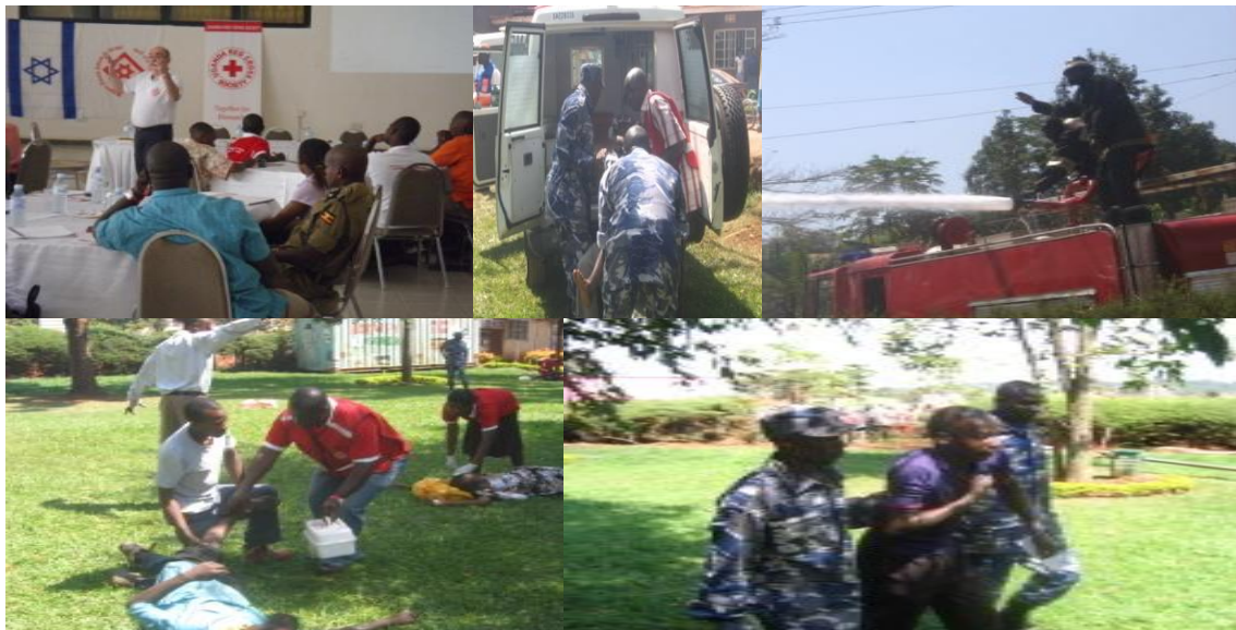
Trainees in training session and responding to accident and bombblast victims during the mini simulation exercise

22 participants (5 Staff, 12 first aid volunteers, and 5 participants: 3 females: 19 males) from partners namely Uganda police -emergency & fire brigade unit, Mulago National Referral Hospital, Civil Aviation and Office of Prime Minister for Disaster Preparedness were trained in emergency medical technician training with specific focus on emergency mass casualty management and coordination knowledge & skills in preparation for effective emergency future responses to disasters. The training was facilitated by 2 technical persons from MDA –Israel and 1 resource person from Uganda police from 13 th -20 th December in Mukono and ended with a mini-simulation exercise that was conducted. As a result of the training there is progressively improvement in coordination of URCS with other partners and the trained team is also supporting both branch and national level response activities.