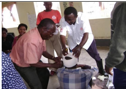
The first Aid instructor takes the volunteers through practical of first Aids in a training session in Bundibugyo

Cross Action team members (55 females: 117 males) were trained to support their branches preparedness and response activities.