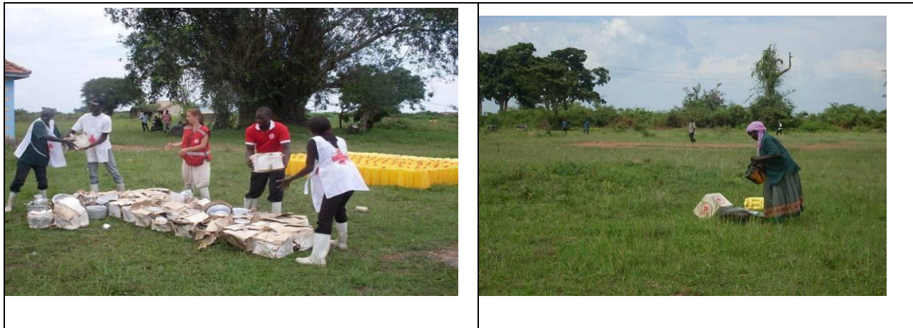
RCAT volunteers joined by a volunteer (youth exchange from Germany.) distributing relief to floods affected in Kolir Sub county in Kumi district. Left is one of the beneficiaries with her kit