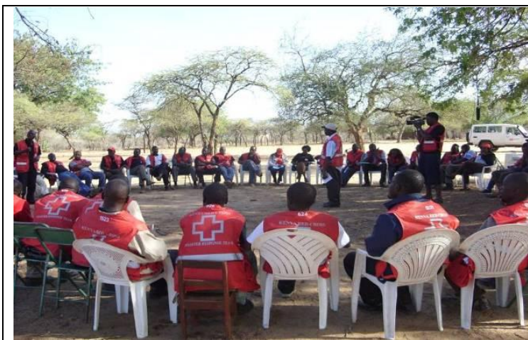
The team leader from URCS conducting a feedback session after an activity