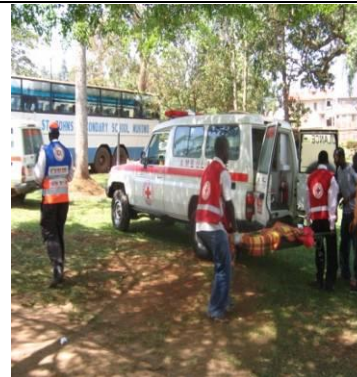
First aid staff and volunteers & response partners in a mini-simulation exercise at Mukono Town Council