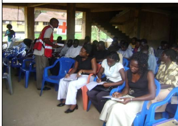
RCATs attending a training sessions in Kampala East branch