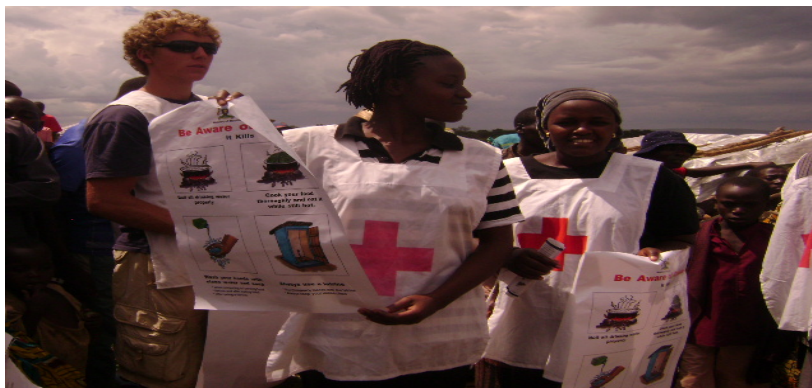
Red Cross volunteers displaying posters about cholera in Nakivale camp

The branch has tried her level best to save the lives of the most vulnerable people. 45 volunteer have participated in food distribution and cholera sensitization in Nakiivare refugee settlement