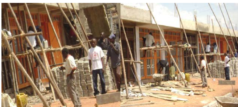
The focal person in Red Cross T-shirt supervising The construction of the shopping Mall

The Branch project of building shopping mall is still going on well. The construction is now at the ground floor. It is hoped that the Branch will be able to complete the construction such that her capacity of locally generated revenues can be improved hence self-capacity sustainability.