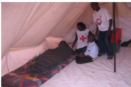
The first Aiders attending to the causality that Hard collapsed On Dec. 3, 2008 during International Disabled day celebrations at Booma ground in Mbarara district.