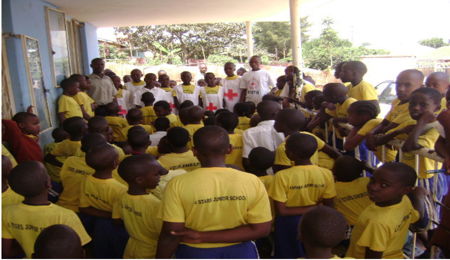
Rugazi Progressive P/school performing a play about proper usage of road signs especially zebra crossings.