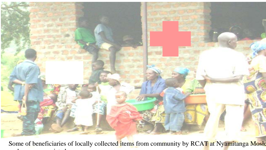
Some of beneficiaries of locally collected items from community by RCAT at Nyamitanga Moslem community center. Over 40 orphans were assisted.