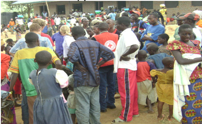
B F C sensitizing refugees on tracing needs in Nakivale Refugee settlement

The Branch conducted one assessment about the cholera out break in Nakivale refugee settlement and other tracing needs. The report was sent to Headquarters DM department for action. The Branch received the reply and some of the contents are being implemented.