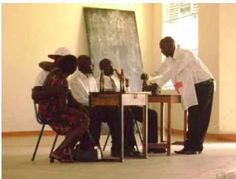
Nyamitanga secondary showing dangers of peer pressure