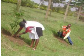
The Red Cross volunteers Jacket emphasizing on tree spacing for good yields

The central link has come up with an initiative of conserving the climatic charges and protecting the environment through tree planting. This quarter the link planted 120 pine trees coming to 500 trees.