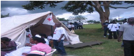
The Red Cross first Aid team together with the district healthy teams on world Aids day celebration in Mbarara district

The Branch carried out First Aid training at Katete community centre. During the training, 25 community people attended the training i. e (09 females and 15 males). It is hoped that the skills acquired will help them to overcome community emergencies