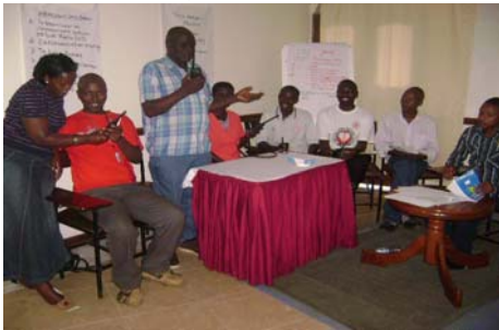
The instructor showing the participants the distance of holding the VHF radio call

The Branch hosted the Radio call training which attracted the six Branches in Mbarara region. The branches which participated include the following: Kabale, Kisoro, Rukungiri, Ntungamo, Bundibugyo and Mbarara. 14 people attended the training whose main objective was to acquire skills and knowledge in communication. The training was held at Wasteland Hotel from December 5-7, 2008.