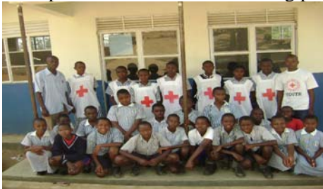
Volunteers pose for a photo after community service at Katete community center

This has been done in schools and communities especially in Katete Ward. 30 women together Red Cross volunteers participated in cleaning. The objective of activity was to improve hygiene and sanitation. This picture created good will among the community members and 23 people (12 females and 11 males) joined Red Cross as members and the promise was made by Local Council Chairperson to continue sensitizing people about disaster mitigation.