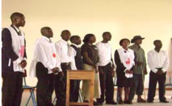
Nyamitanga technical link staging a song about the scourge of Aids in today's generation

The branch conducted the HIV exhibition at Ntare school on 30 th November, 2008 under the theme “Healthy Relationship and HIV prevention Among the youth” were by the following links participated: Mbarara High School, Ntare School, Nyamitanga secondary school, St Joseph Vocational school, Nyakayojo secondary school, Mbarara University, Ruharo Vocation training, Nyamitanga technical school, Clever land High school, Kakoba University and Kinoni girls. During the concert, three best schools i.e Ntare School was the first, Mary Hill Girls, the second and Nyakayojo took the third position. These schools were given special certificates of performance and the rest got the certificate of participation. During the function, the guest of honor was the Chairperson, Branch Governing Board Mbarara Branch who represented the President Rotary Club of Mbarara.