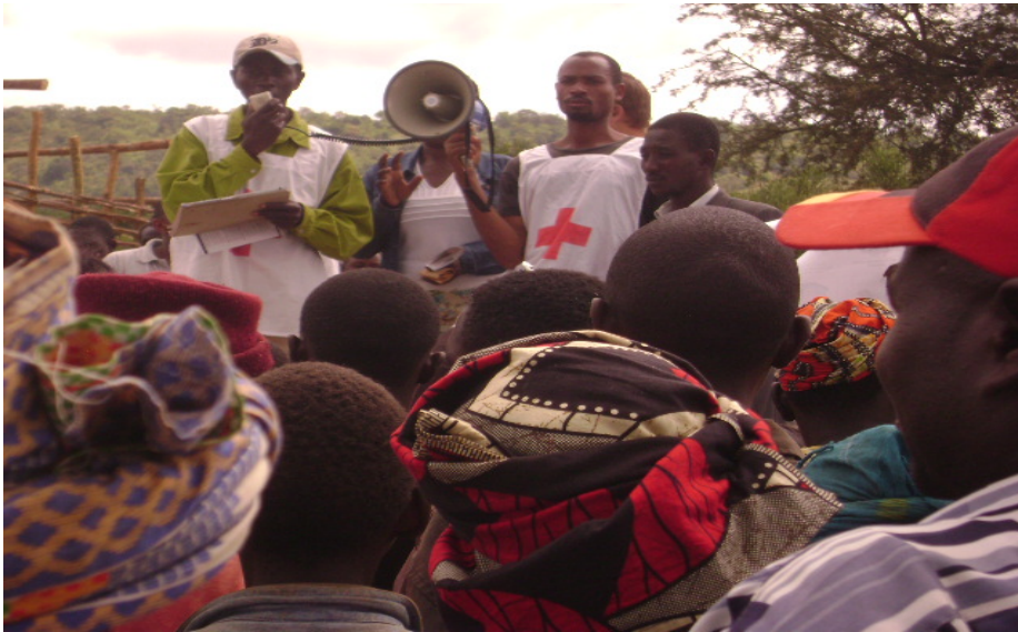
Red Cross volunteers carrying out sensitization about cholera in Nakivale camp