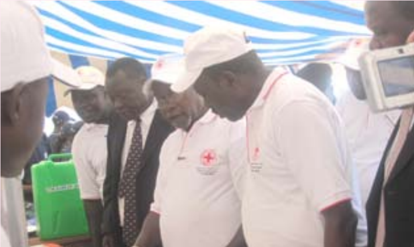
Prof. Tarsis Kabwegere Minister for Disaster Preparedness inspecting Red Cross stall at Malukhu grounds Mbale during the Red Cross Day Celebrations.