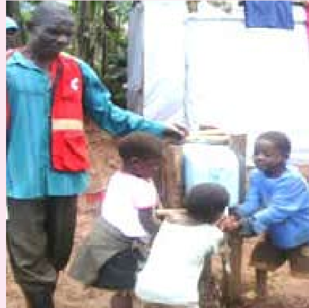
Children washing their hands in Bulucheke camp-Eastern Uganda