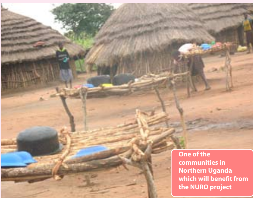
One of the communities in Northern Uganda which will benefit from the NURO project