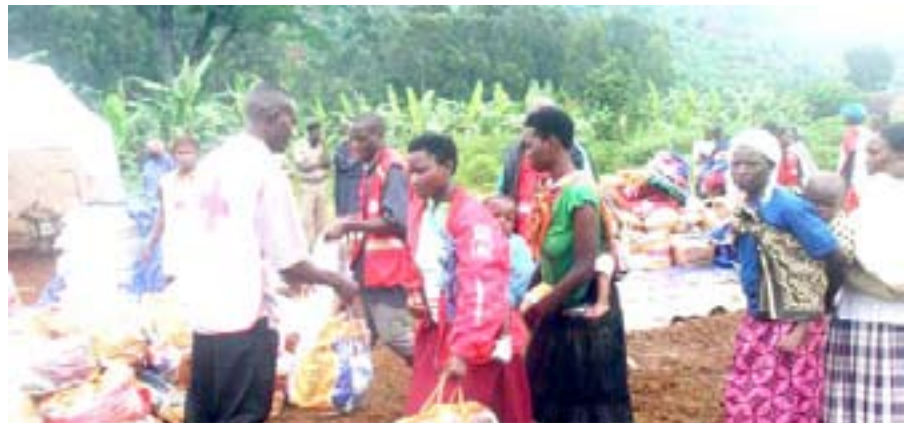
Distribution of essential household items in the region

Activities carried out to ensure sustainable improvement in the quality of life of the most vulnerable in the region included training Branch Youth Coordinators, exchange visits, training on Life Planning Skills and Project Planning and Management