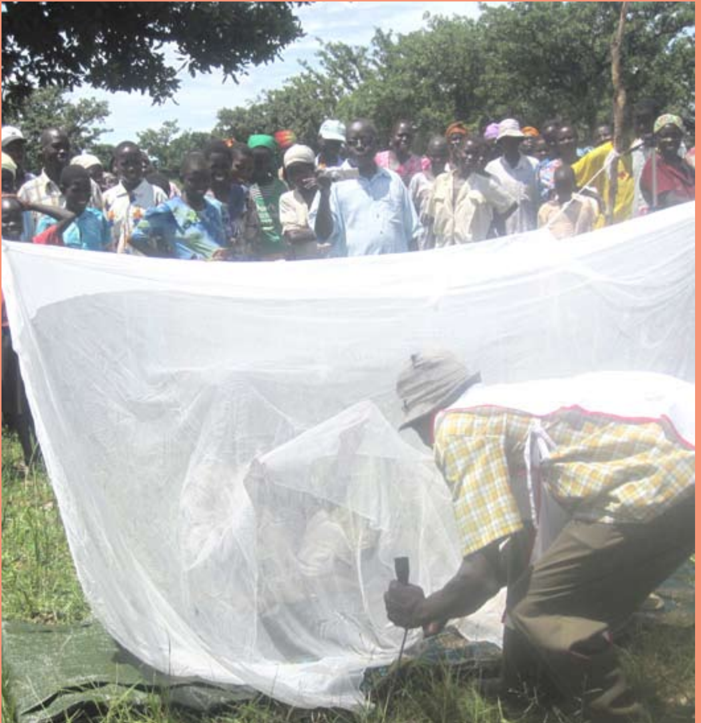
A URCS volunteer demonstrating to communities of Kapelebyong, Amuria District how to properly hang a mosquito net