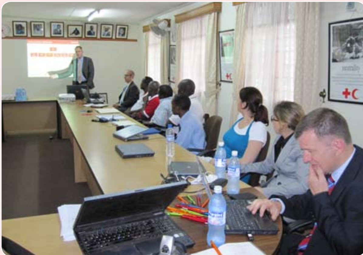
A cross section of URCS management team and members of the Ordina team attending a debriefing session at URCS headquarters.

A team of 9 experts from Ordina, Esteem work and Netherlands Red Cross were in the country for one and half week to support Uganda Red Cross Society build its capacity in ICT, Planning, monitoring and evaluation and setting up income generating activities like Internet Café for Hoima region.