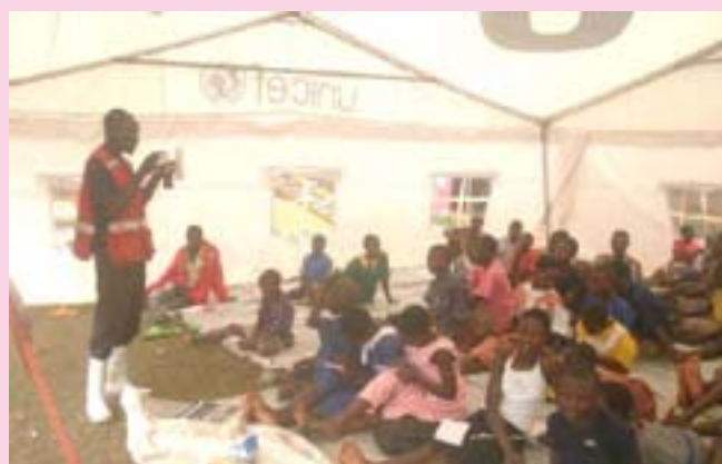
A URCS volunteer talking to children at Bulucheke camp in Eastern Uganda