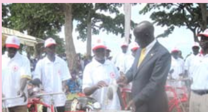
State Minister for disaster preparedness Musa Ecweru handing over bicycles to communities during the launch of the disaster risk reduction in Katakwi