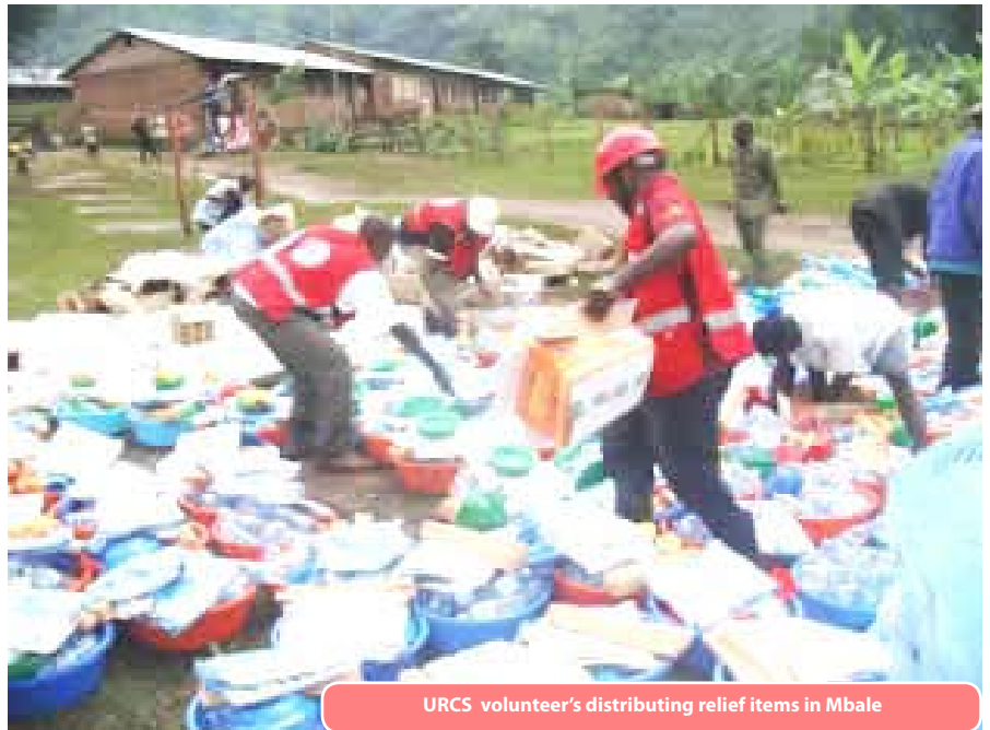
URCS volunteer's distributing relief items in Mbale