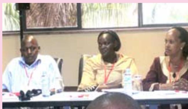
Some of the participants attending the launch of the Eastern Africa Planning, Monitoring and Evaluation Network at Munyonyo