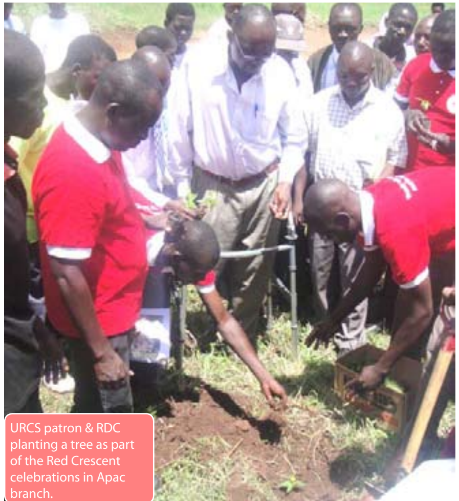
URCS patron & RDC planting a tree as part of the Red Crescent celebrations in Apac branch.

“You need to be advocates on the elements of the group attitudes and integrate what ever you are doing with activities of Red Cross activism and be patriotic in what ever you are doing,” he advised