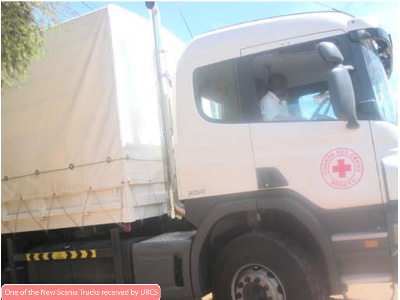
One of the New Scania Trucks received by URCS

“The trucks are fitted with a satellite monitoring system which means that the fleet manager will be able to monitor the location of the trucks throughout the country and immediately detect any abuse of office at the click of the mouse!”.