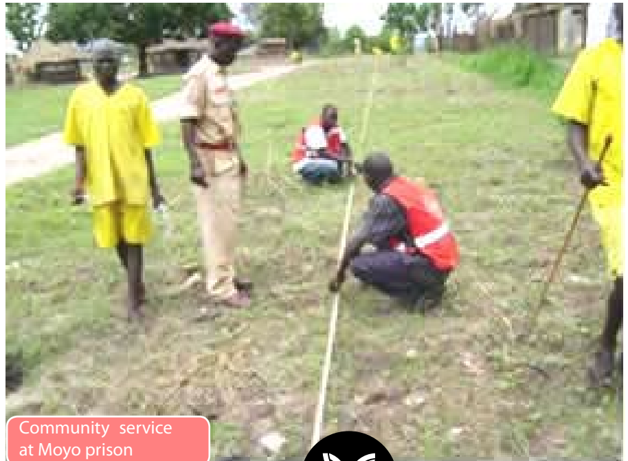
Community service at Moyo prison

The branch volunteers and branch governing board arrived at the prison, ready to demystify the perception of perversion and incarceration to the communities around the prison and the entire community in the district so as to impart the sense of acceptance,