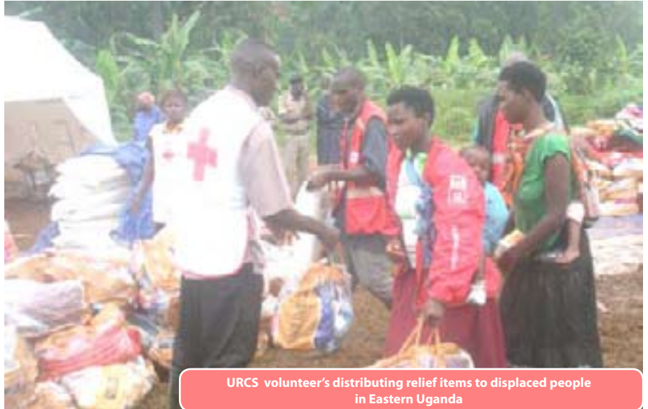
URCS volunteer's distributing relief items to displaced people in Eastern Uganda

Meanwhile, over 300 people who were traveling to and from Kanungu were stuck in the Enengo gorge at Nyakagyeme after landslides blocked the road at Kamujegye in Rwerere, Rukungiri district.