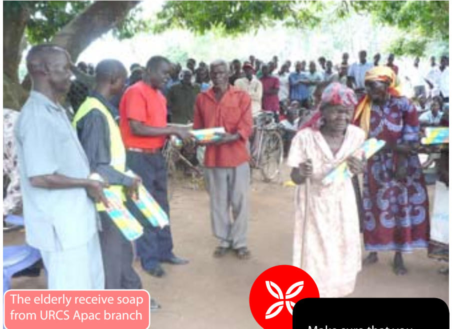
The elderly receive soap from URCS Apac branch