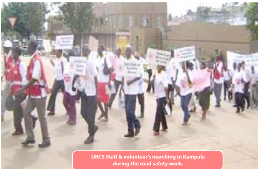
URCS Staff & volunteer's marching in Kampala during the road safety week.

In support of the Uganda Government road safety efforts through Uganda National Roads Authority (UNRA), the Uganda Red Cross Society participated in this year's National Road Safety Campaign Week from 29th March to 1st April 2010. This was aimed at increasing road safety awareness among primary and nursery school going children and the general public under the representation from four URCS branches of Kampala South, Kampala Central, Kampala West, and Kampala North.