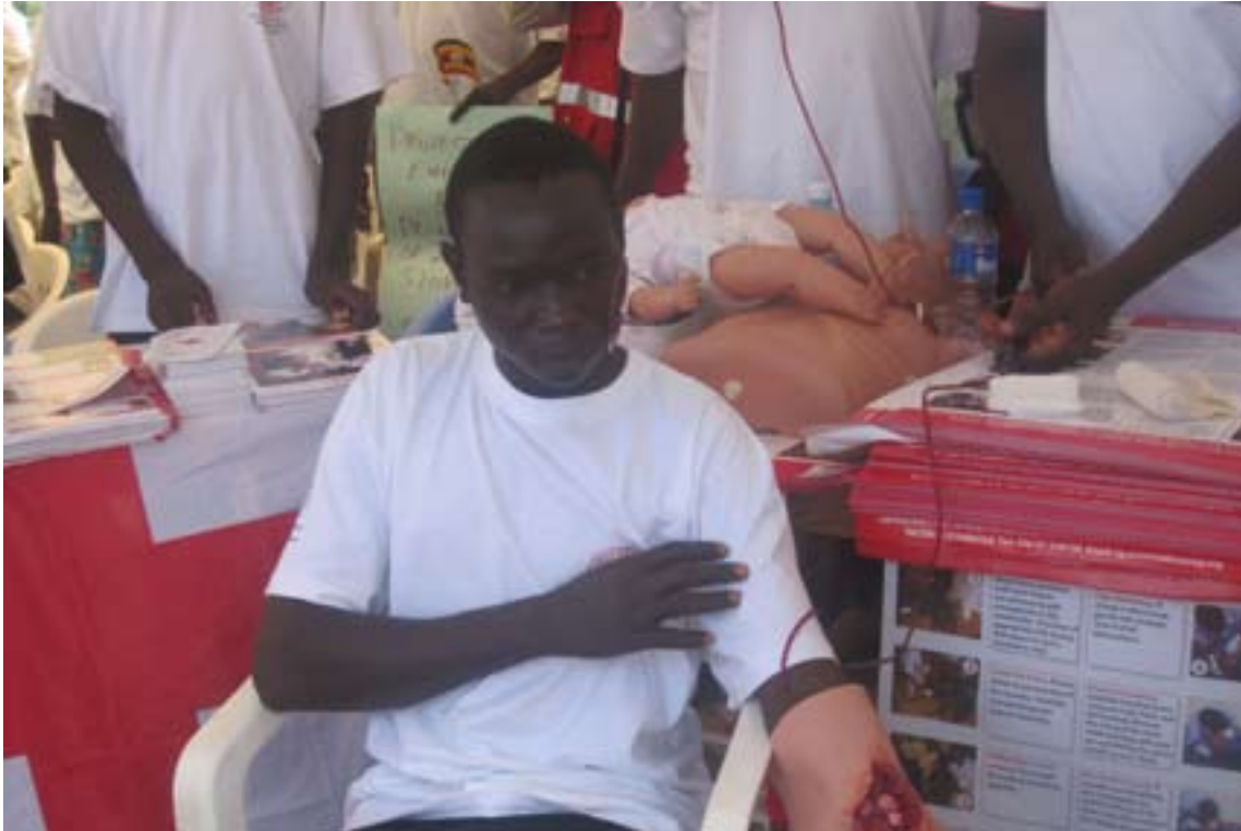
A volunteer demonstrates how first aid is administered at the Red Cross exhibition stall during the Red Cross week celebrations.