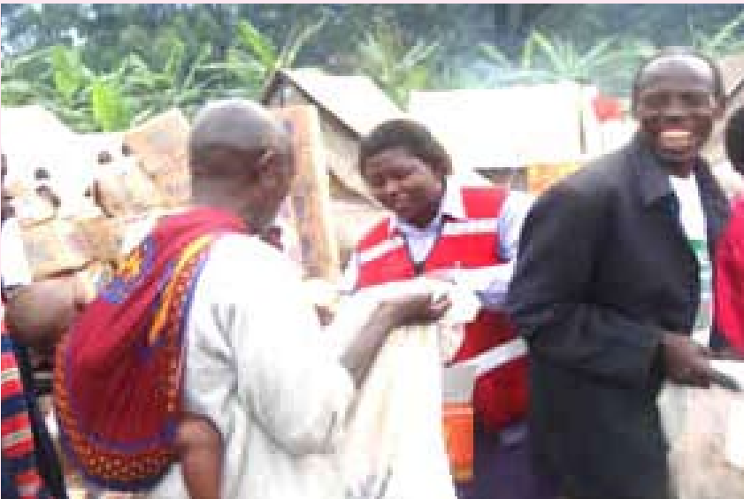
Displaced people receive food in Bulucheke camp during Easter time