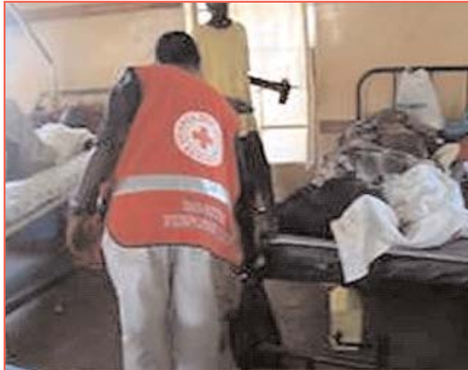
An Arua Branch volunteer taking care of patients.

The farmers got involved in the accident as they were being transported to British American