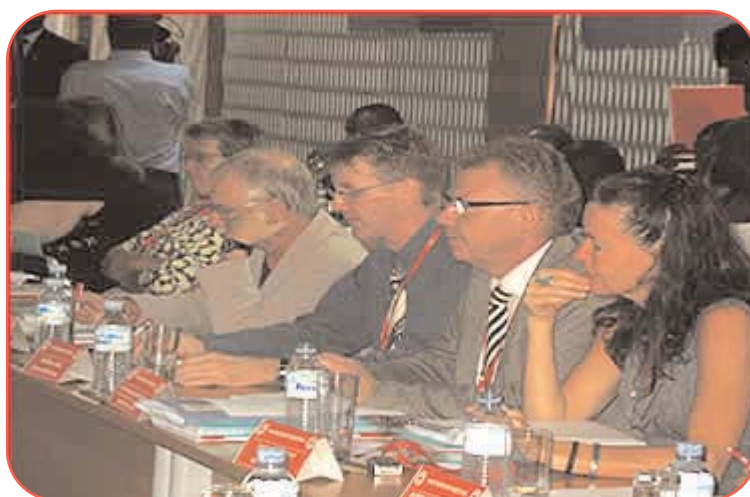
Some of the partners that attended the URCS 2009 partnership meeting at Hotel Africana.

The field staff of the Uganda Red Cross Society took it as a challenge as most of their branches had not invested in real estates as a means to generate income for their branches.