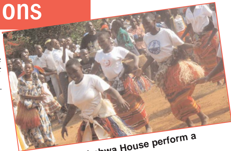
Members of Ssimbwa House perform a Kiganda dance.