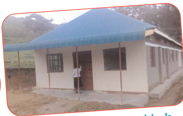
The Rakai multi-purpose block