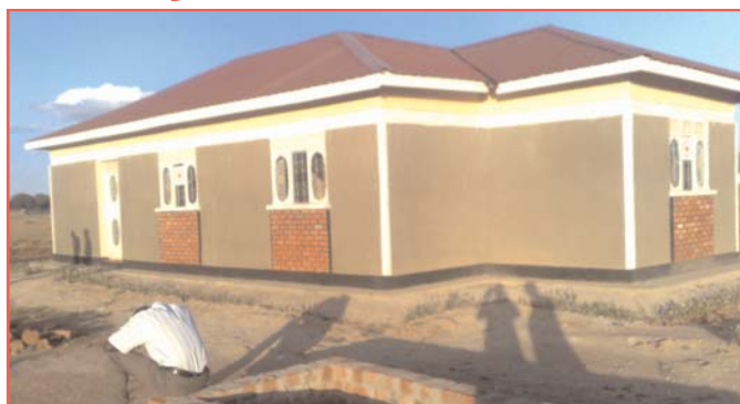
Kotido multi-purpose block