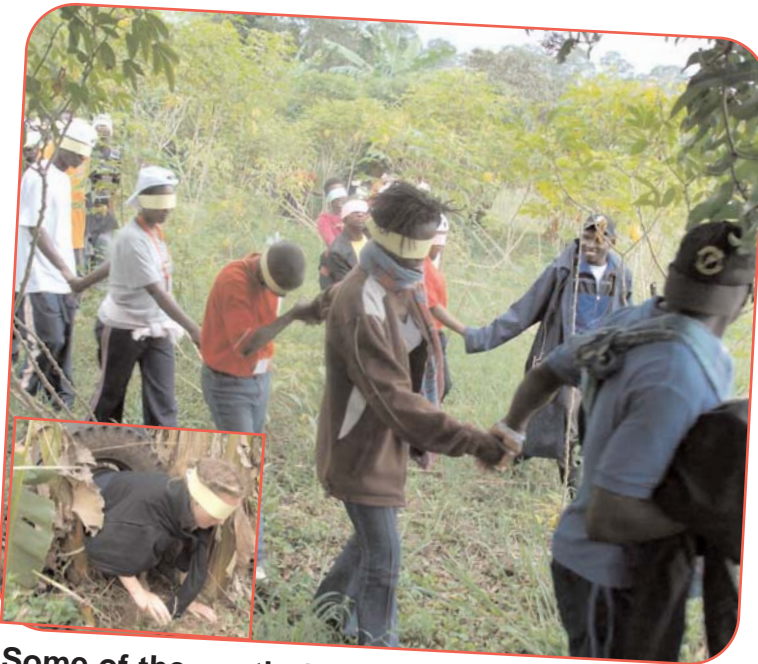
Some of the youth during a treasure hunt at the International Youth Camp at the African Leadership Training Centre in Namakwa, Mukono.