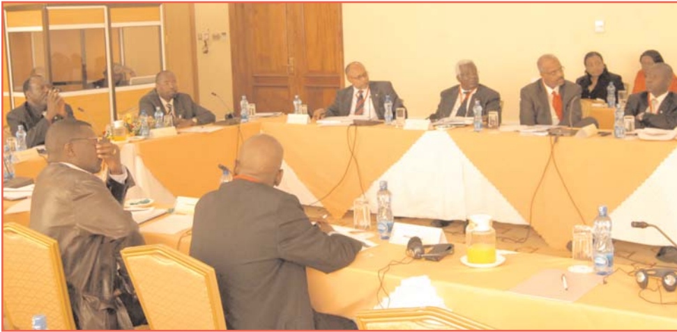
Representatives on the New Partnership for African Red Cross and Red Crescent Societies (NEPARC) during the body's General Assembly in Nairobi, Kenya. The Assembly among others discussed the NEPARC activity report February-August 2009, NEPARC and the 5-year SGS and NGOs benchmarking standard experience, Strategic Alliance building, Strategic partnership and Strategic thinking on NEPARC 5-year achievements.