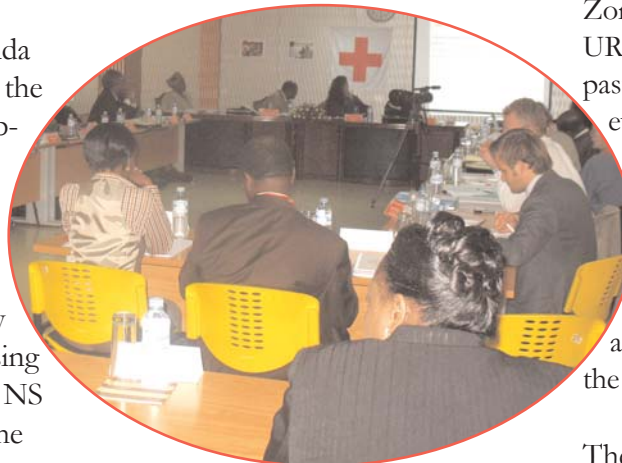
Some of the URCS staff and officials from other National Societies that participated in the partnership meeting.