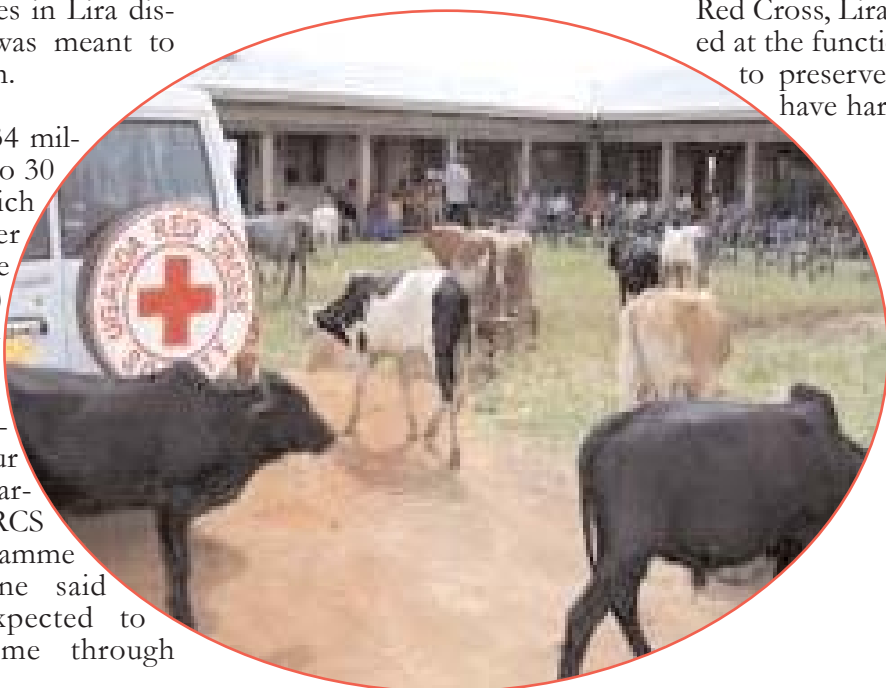
Some of the oxen that were distributed to Lira farmers at Ogur Sub County headquarters.