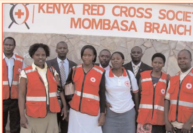
The URCS Mbale Region staff at the Kenya Red Cross Society Mombasa Branch offices.